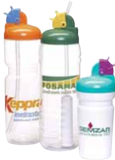
Pharmaceuticals Prescribe your products with Power Bottles... Just what the doctor ordered