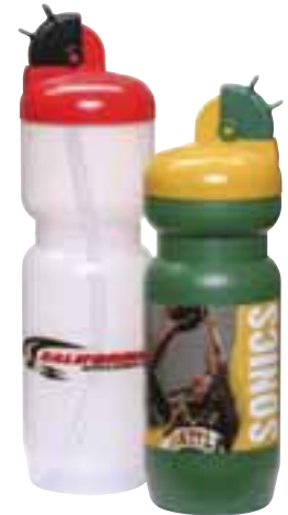
Sporting Events Slam dunk the competition when you team up with Power Bottle USA