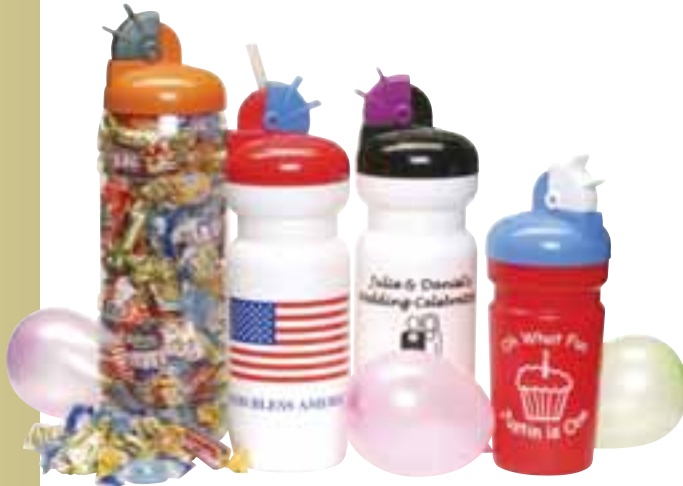
Special Occasions Create a memory with the perfect "Thank You"

The Power Bottle's patented leak-proof and sanitary design make it the premier water bottle on the market today. Power Bottles are ideal for any event, occasion, promotion or activity. Acting as a "Cylindrical Billboard", they provide exceptional advertising value everywhere they go.