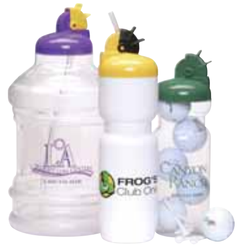
Resorts, Spas & Clubs Shape up your next promotion